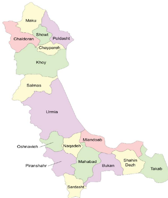
Fig 1. Map of West Azerbaijan province

East Azerbaijan, Zanjan and Kurdistan. Azerbaijan is about 40,000 square miles (100,000 square km) in area and also in 2011 the province had a population of 3,080,576. Figure 1 shows the map of West Azerbaijan province.