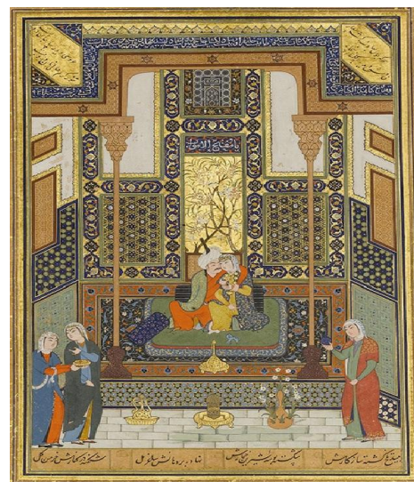
Figure 2. Painting of the marriage of Khosrow and Shirin by 16th Century painter Shaikh Zada

Apart from using paintings and calligraphy to elaborate this love story, new versions of the story have emerged in different parts of Iran. The story has gone beyond the boundaries of the then